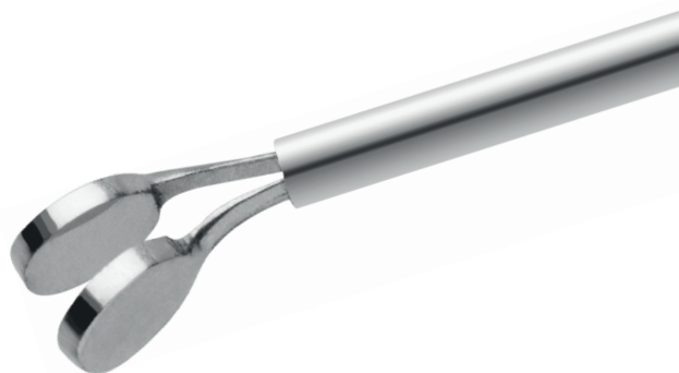
651078: ICL Forceps Serrated without holes 21G