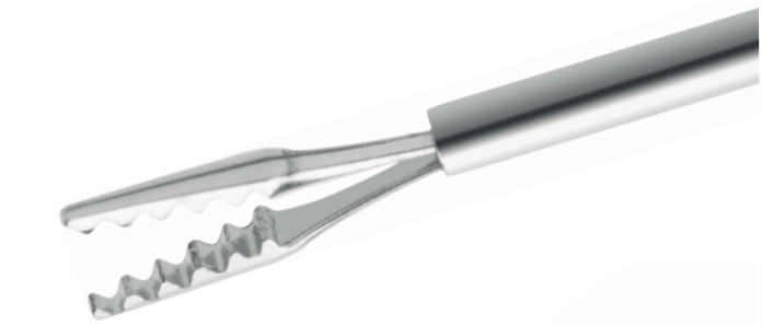
651092: Corneal Endothelium Forceps